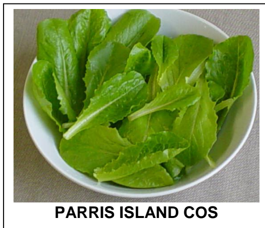
PARRIS ISLAND COS